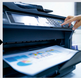
Scanner & Multifunction Printer