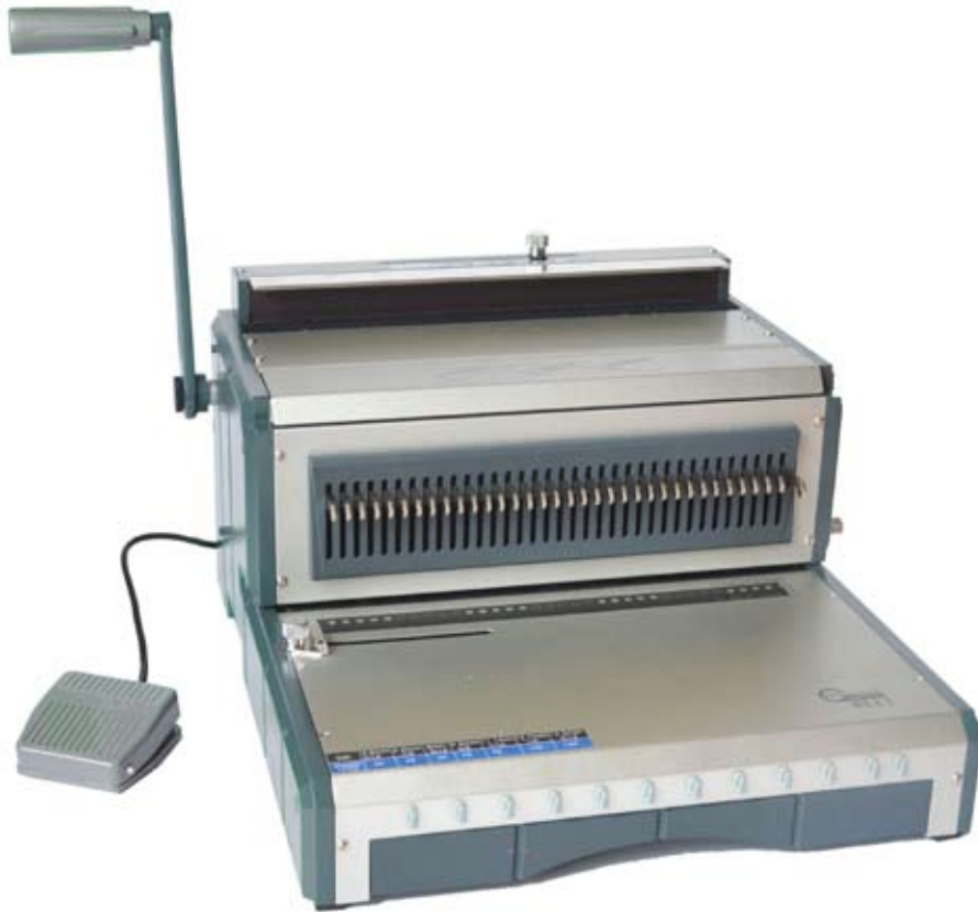
selectable punching pins