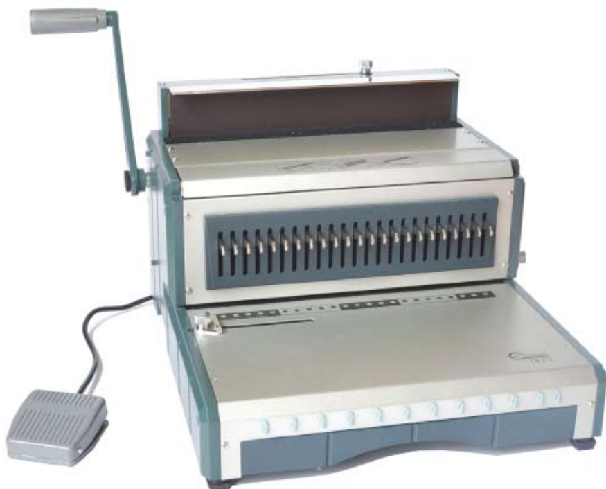
selectable punching pins